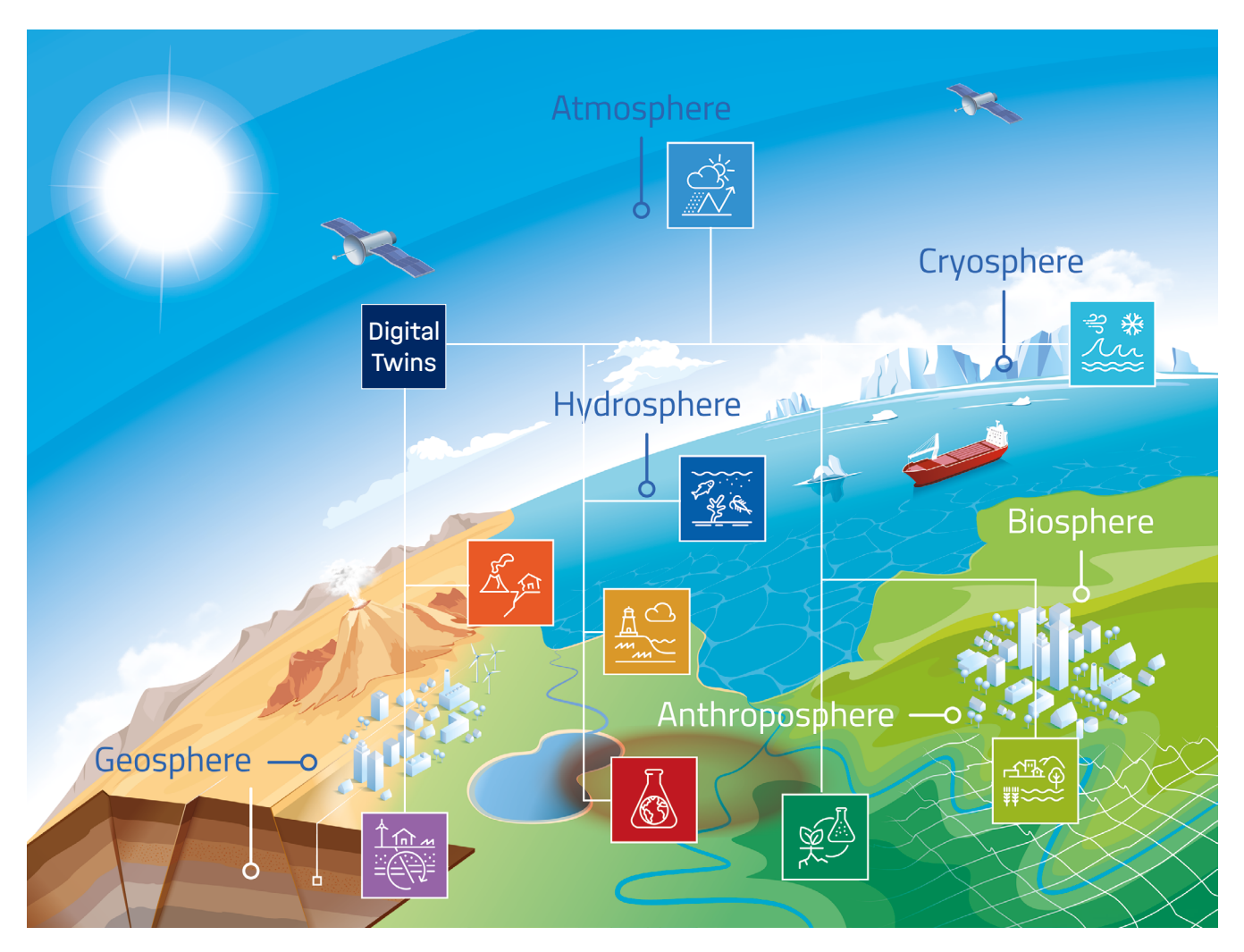
Fig. 2: The research program of the Helmholtz Research Field Earth & Environment with its nine Topics (icons) reflects the complexity of the Earth system with its six subsystems and their interconnectedness.